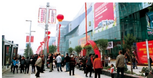
▲ Marketing campaign in CSC Xi'an for up and coming trial operation 西安華南城為試業舉行宣傳活動