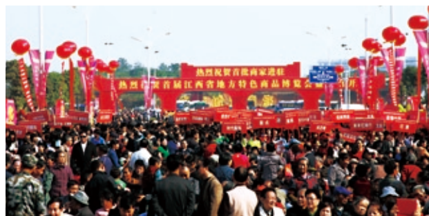
▲ Hong Kong, Macau and Taiwan Commodity Fair at CSC Nanchang 於南昌華南城舉行的港澳台商品交易會

有見南寧華南城試業在即，本集團積極籌辦交易會及活動，以加強市場關注及增加人流。南寧華南城於2013年4月28日至5月2日舉辦春季茶葉展，會上展覽各式各樣的茶葉及茶具。活動盛況空前，吸引超過150,000參觀人次到訪。