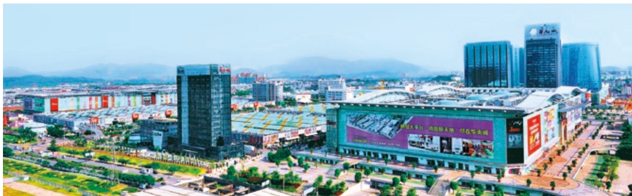
▲ CSC Shenzhen in operation 在營運中的深圳華南城

有見家具、家裝及家飾市場在國內的發展前景，及為加快拓展有關業務在各地華南城項目的發展，本集團於2013年7月29日簽訂認購協議，收購好百年家居75%權益(於交易完成時的權益)。我們預期好百年家居的業務可與本集團現有的業務產生協同效益，滿足華南城發展規劃上的需求。