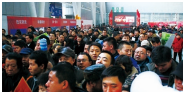
▲ The launch of sale at CSC Harbin 哈爾濱華南城開盤盛況