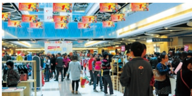
▲ Trade center of CSC Shenzhen in operation 在營運中的深圳華南城交易中心

相較2012/13財政年度上半年，本集團於2013/14財政年度上半年的租金收入上升14.2%至114.8百萬港元，主要由於深圳華南城於本期間內重續租約及新簽訂租約令租金上調。於2013年9月30日，一期交易中心及商舖的總佔用率及租金單價分別為95%及44港元/平方米(於2012年9月30日：96%及36港元/平方米)。二期交易中心及商舖已推出可出租建築面積的總佔用率及租金單價分別為60%及37港元/平方米(於2012年9月30日：51%及34港元/平方米)。