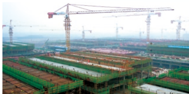
▲ CSC Hefei under construction 在建的合肥華南城