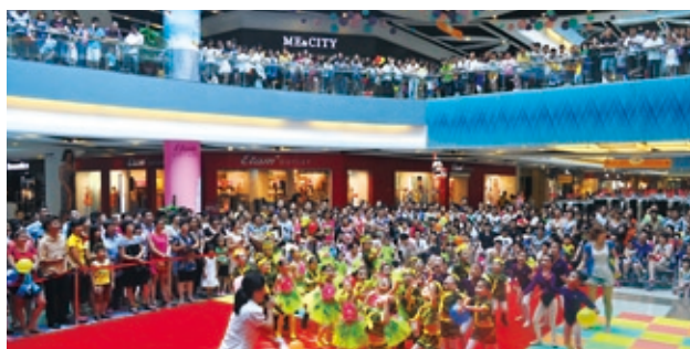
▲ Marketing campaign held at outlet center, CSC Shenzhen 於深圳華南城奧特萊斯中心舉行的宣傳活動

The outlet team of the Group is committed to bringing in value branded goods and to boosting overall traffic flow. The Group opened its first outlet center in CSC Shenzhen in April 2011 mainly featuring global sportswear and outdoor brands initially, but it now accommodates about 150 brands of sportswear, casual and outdoor wear, men's and women's fashion, kid's wear and travel products, occupying approximately 49,700 sq. m.. Building on the successful opening of the outlet center at CSC Shenzhen, the Group continues to expand and replicate this business further at its other projects. The outlet centers at CSC Nanning, CSC Nanchang and CSC Xi'an are scheduled for trial operation in Q4FY2013/14; renowned brands of different themes that have already committed to join include but not limit to Nike, Adidas, 361°, Crocs, Etam, Me&City, etc.