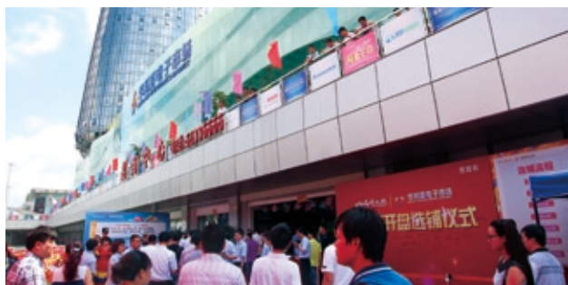
▲ Pre-sale of Plaza 5 at CSC Shenzhen 深圳華南城五號廣場預售盛況

憑藉華南城成功於全國複製其獨特商業模式、多元化的項目組合及歷年建立的商譽，本集團繼續於2013/14財政年度上半年保持增長勢頭，期內收入增長27.5%至3,197.0百萬港元（2012/13財政年度上半年：2,507.3百萬港元）。隨著旗下項目陸續推出，本集團期內合約銷售顯著攀升至約5,787.1百萬港元，按年上升202.2%（2012/13財政年度上半年：1,915.2百萬港元），佔本集團本年度的銷售目標110億港元的52.6%。