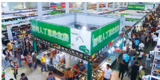
▲ China — ASEAN Light Industrial Product Fair at CSC Nanning 於南寧華南城舉行的中國—東盟輕工業產品展覽會

For the up and coming trial operation at CSC Nanning, the Group proactively organizes trade fairs and events to draw attention from the market and boost traffic flow. CSC Nanning organized the Spring Tea Festival, held between 28 April and 2 May 2013, which showcased an array of tea and tea wares. This commercial trade fair received an overwhelming response, attracting over 150,000 visit counts.