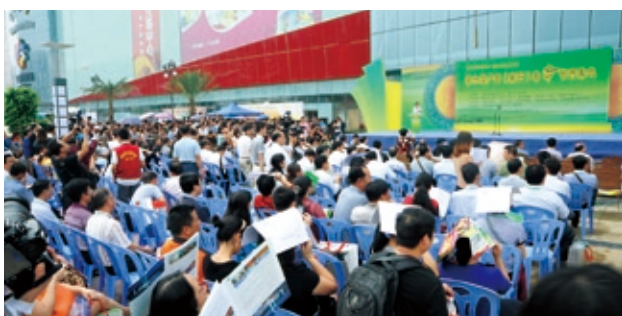
▲ Marketing campaign in CSC Nanning for up and coming trial operation 南寧華南城為試業舉行宣傳活動

於2013/14財政年度上半年，南寧華南城錄得合約銷售298.5百萬港元(2012/13財政年度上半年：396.7百萬港元)，其中以平均售價16,800港元/平方米售出總建築面積5,100平方米的交易中心(2012/13財政年度上半年：以平均售價15,600港元/平方米售出總建築面積25,500平方米)及以平均售價7,100港元/平方米售出總建築面積30,100平方米的住宅單位(2012/13財政年度上半年：無)。