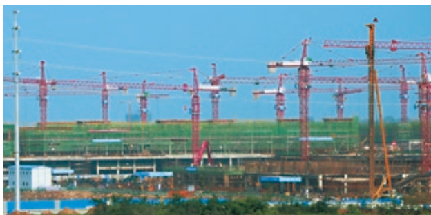
▲ CSC Zhengzhou under construction 在建的鄭州華南城

於2013/14財政年度上半年，鄭州華南城交易中心(單幢)展開預售，反應熱烈，錄得合約銷售1,896.6百萬港元(2012/13財政年度上半年：無)，以平均售價8,300港元/平方米售出總建築面積229,400平方米。