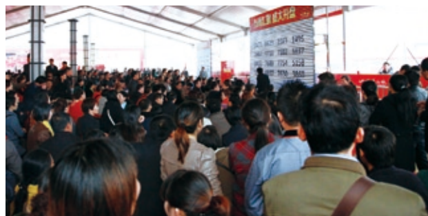
▲ Pre-sale in CSC Hefei in November 2013 合肥華南城2013年11月預售盛況