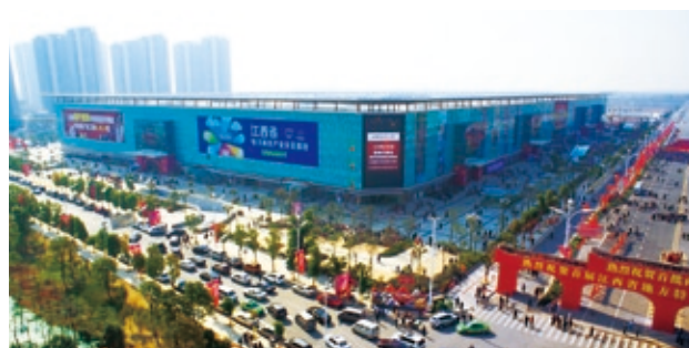
▲ CSC Nanchang for trial operation in full swing 南昌華南城為試業準備如火如荼