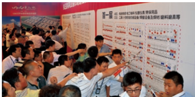
▲ The launch of sale at CSC Zhengzhou 鄭州華南城開盤盛況