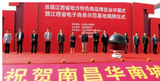
▲ CSC Nanchang "Model Base of E-commerce of Jiangxi Province" 南昌華南城獲評為「江西省電子商務示範基地」

本集團的奧特萊斯團隊致力引入超值的品牌商品，以及增加項目整體人流。於2011年4月，本集團在深圳華南城開設首個奧特萊斯中心，最初主要以國際體育及戶外品牌為主，迄今已囊括約150個集體育運動、休閒戶外、男女服裝、童裝及旅遊用品等知名品牌，佔地約49,700平方米。建基於深圳華南城奧特萊斯成功的營運基礎，本集團將繼續擴展及複製此業務至其他項目。南寧華南城、南昌華南城及西安華南城的奧特萊斯中心預期於2013/14財政年度第四季度試業，並已有不同主題的知名品牌承諾加盟，包括但不限於耐克、阿迪達斯、361°、卡洛馳、艾格、Me&City等。